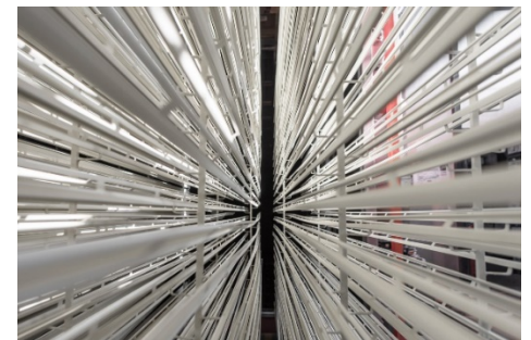
Cut & Aging