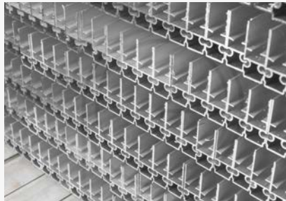
Powder Coated Aluminium Profiles

The manufacturing process starts with the aluminium billets heated and then pushed by a hydraulic cylinder through a die with the required cross-section. The aluminium profile extruded is then cooling down, stretched and cut to the desired length. This is followed by aging with heat treatment in order to improve the mechanical properties of the products. The products continue either for packaging and storage or for coating. The extruded aluminum profiles to be painted by powder coating are cleaned with soap and chemical baths in order to passivate the surface and then powder coated electrostatically.